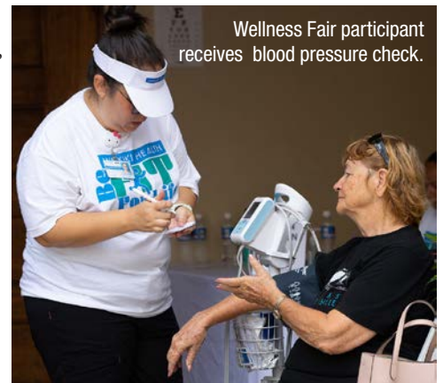
Wellness Fair participant receives blood pressure check.

In honor of National Health Center Week, Waikiki Health once again hosted an annual Wellness Fair with interactive and informational booths to showcase the essential and innovative services we offer across our 5 clinic sites. With increased awareness of the importance of Community Health Centers, participants were encouraged to become their own "Health Advocates."