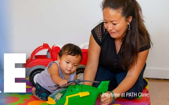
Playtime at PATH Clinic