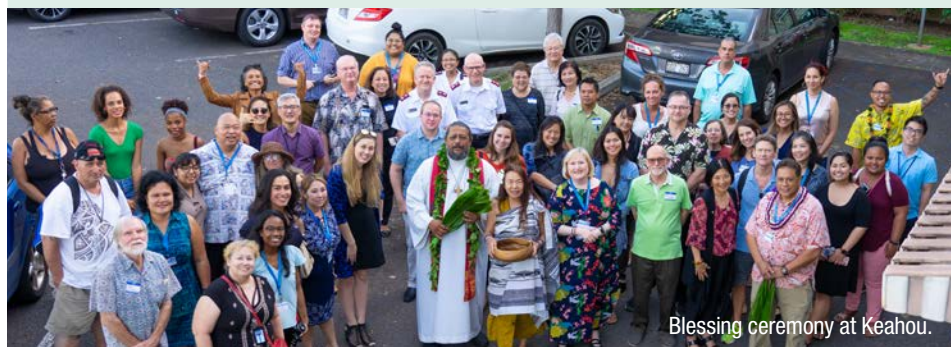
Blessing ceremony at Keauhou.

Keauhou, like Next Step Shelter, uses the Housing First model, which places clients in housing as quickly as possible, followed by client-centered "wrap-around" services. The goal is to have half of the Keauhou residents document-ready and prepared to move into permanent housing within 90 days, making room for new members.