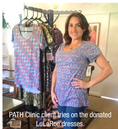
PATH Clinic client tries on the donated LuLaRoe dresses.