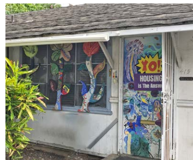
Youth Outreach Clinic in Waikiki