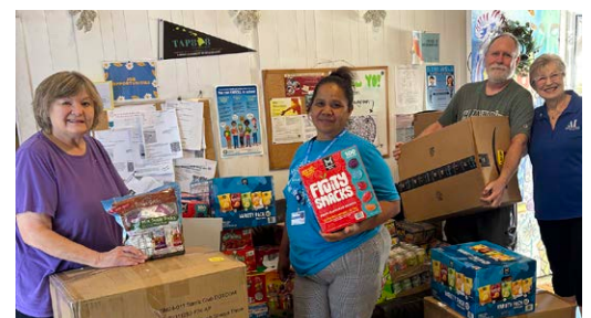
Assistance League of Hawaii donated numerous items to YO!

In addition, a special mahalo to the Assistance League of Hawaii (ALH) for their kindness in making the holidays brighter for Waikiki Health's Youth Outreach (YO!) clients. ALH donated canned goods, blankets, socks, hygiene items, snacks, and healthy drinks. They also contributed 60 baby layettes to our PATH Clinic for new mothers. With the continued support of long-time partners like ALH and Hale Kipa, we can help vulnerable populations in our state enjoy a more joyous holiday season. Mahalo nui to all!