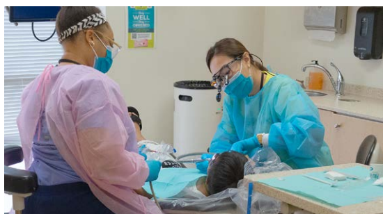
Keiki receiving screening at the Makahiki Dental Clinic.