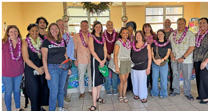
Zilber Family Foundation board and staff members visited Keauhou Shelter.