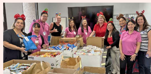
Waikiki Health 'elves' stuffed the Gift of Giving bags.